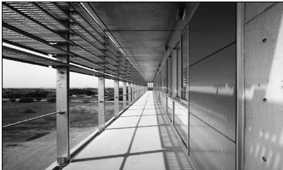
Figure 3 Building Envelope showing shading and ventilation for energy savings, Kashiwa Campus, University of Tokyo

One means is to tighten already stringent controls on car commuting. Another more far-reaching effort is the campaign "Cool Biz and Warm Biz," to moderate the thresholds for heating and cooling to 19 degrees celcius in the winter and 28 degrees in the summer.