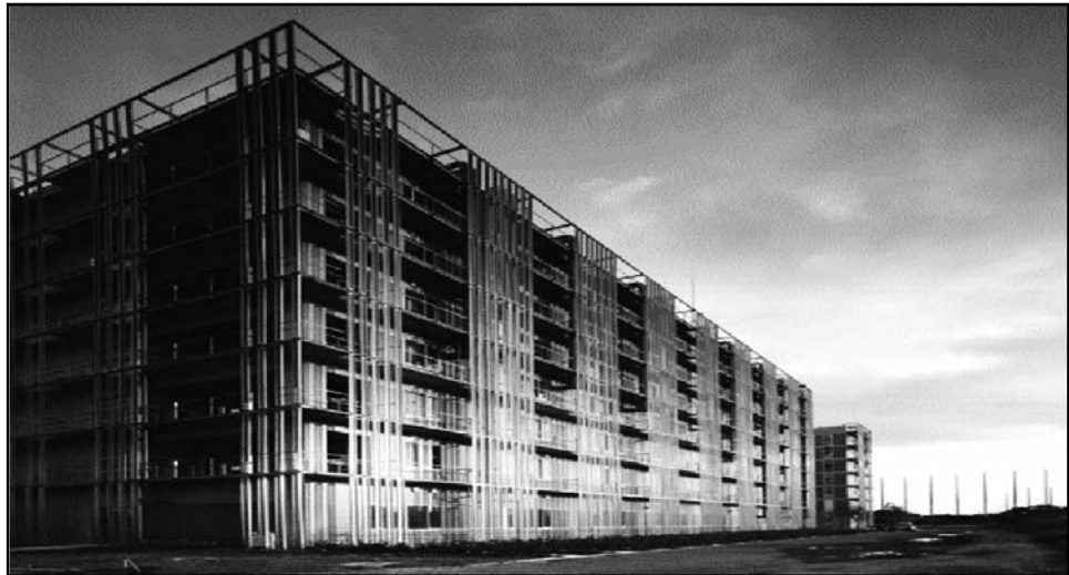
Figure 4 Building envelope showing the louver design for energy savings – Kashiwa Campus, University of Tokyo

Kashiwa Campus houses the Institute of Environmental Studies, which was launched in 1999 and embraces five departments, 70 faculty members and 600 students. Beginning in 2004, a new degree program leading to the title of "Environmental Planner" became available. Growing out of this, a program focusing specifically on environmental design got underway in 2006. In 2007, a Master's Program in Sustainability Science will be offered for the first time. The new program provides students with a sustainability "tool-box" to help advance sustainability at the local, national, or international level. Theoretical and experiential learning are both integral to the degree.